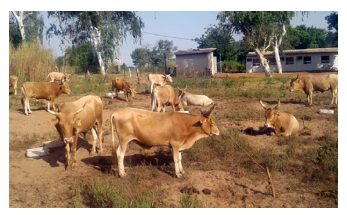
Figure 1. Selected N'Dama cattle breeding bulls in 2019 for the Multiplier tier.

A genetic improvement programme using an Open Nucleus Breeding Scheme (ONBS) involving three tiers was therefore established in 1994 (Bosso, 2007) by the former International Trypanotolerance Centre (ITC), now called West Africa Livestock Innovation Centre (WALIC). The three implicated tiers are Nucleus, Multiplier and Commercial Farmer. The breeding goal of this ONBS is to increase the growth rate and milk yield of indigenous N'Dama cattle without losing their trypanotolerance and other adaptive traits (Jaitner and Dempfle, 1998). Similar breeding schemes for N'Dama cattle genetic improvement are also operational in southern Senegal, Guinea and Mali (Traoré et al, 2017; Camara et al, 2019; Ouédraogo et al, 2021).